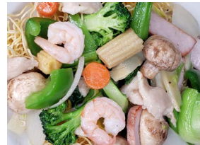
Tang's Chow Mein