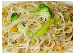
Vegetable Chop Suey