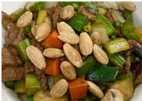
Almond Beef Ding