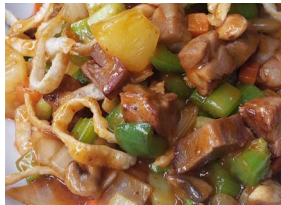
Pork Tiki Tiki