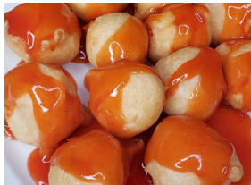
Sweet & Sour Chicken Balls